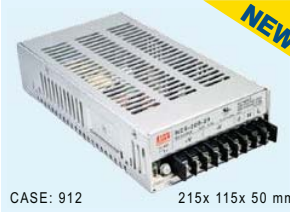
CASE: 912 215x 115x 50 mm