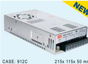
CASE: 912C 215x 115x 50 mm